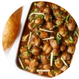
Punjabi Channa Masala