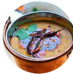
Punjabi Dal Tadka