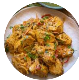
Veg Soya Chaap