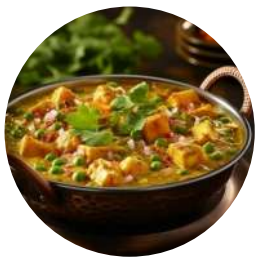
CP Special Navratana Korma