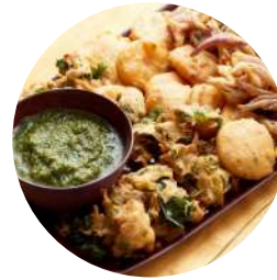
Mix Veg Pakora