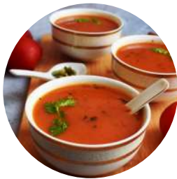
Tomato Dhaniya Shorba