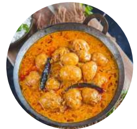
Kashmiri Dum Aloo