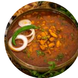
Chef Rajma Masala