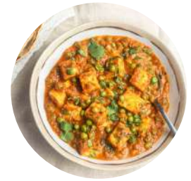
Matar Paneer CHG Wala