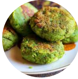
CP Hara Bara Twist