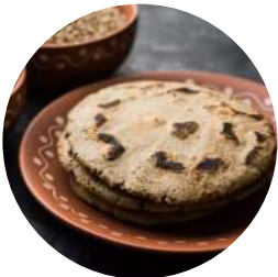
Jowar ki Roti