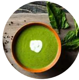
Palak ka Shorba