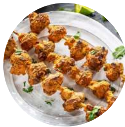
CP Special Mushroom Tikka