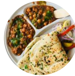
Amritsari Paneer Kulche Choley