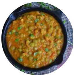
Green Peas Masala