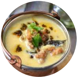
Punjabi Kadhi Pakoda