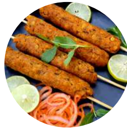
Veg Seekh Kebab