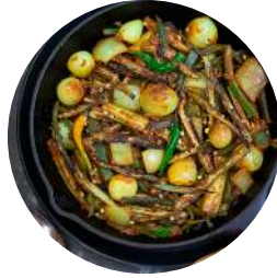
Bhindi Do Pyaza