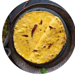
Makke Ki Roti