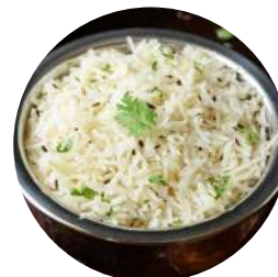
Jeera Tadka Rice