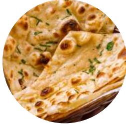
Butter / Plain Roti