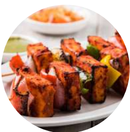
CP Special Paneer Tikka