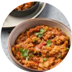
Baingan Ka Bharta