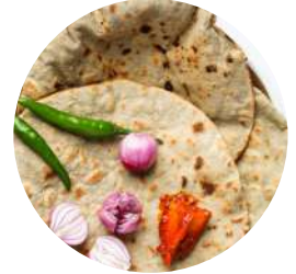
Bajre Ki Roti