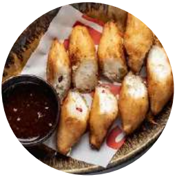
Dahi ke Sholay