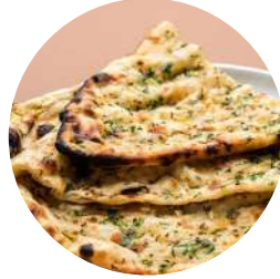
Butter / Plain Garlic Naan