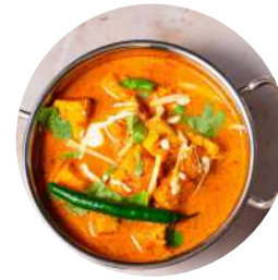
Paneer Tikka Masala