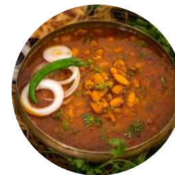
Chef Rajma Masala