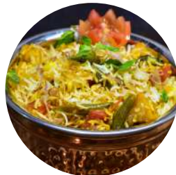
Veg Dum Biryani