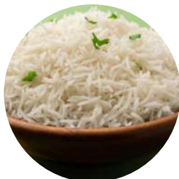
Plain Rice (Basmati)