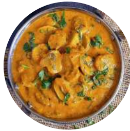
Mushroom Butter Masala