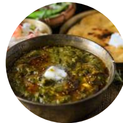
Sarso Da Saag (Seasonal)