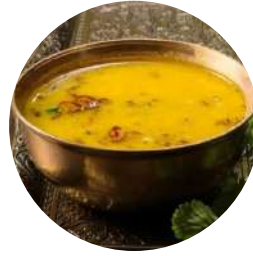
Dal ka Shorba