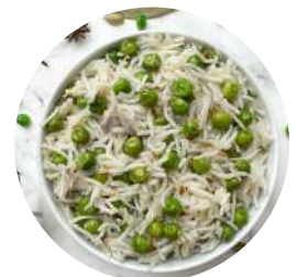
Green Peas Pulao