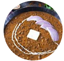
Punjabi Dal Makhni