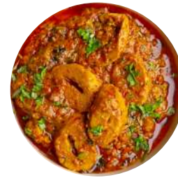
Soya Chaap Tikka Masala