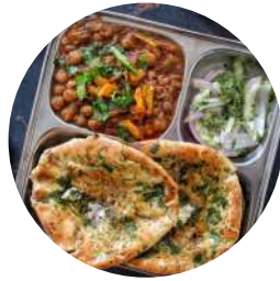
Amritsari Alu Kulche Choley