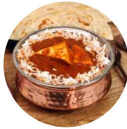
CP Special Paneer Lababdar